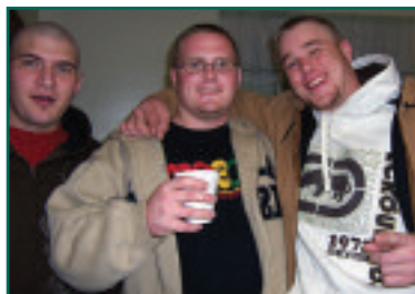
Above: NDTC staff and clients enjoy the wonderful meal.

dinner they provided will stand out in our memories as a wonderful expression of Christian love. We pray that God's blessings will be given in abundance to these wonderful brothers and sisters in Christ!