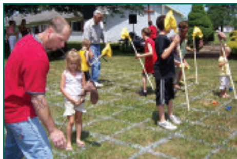
NDTC clients and family members race their homemade horses.

The results are easily seen at our family picnic and it does the heart good.